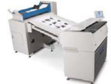
Auto Stacking & Folding