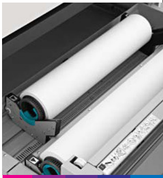
wide format printer/copier/scanner