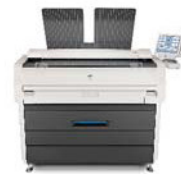
MFP - Single Footprint System

The Energy Star ® qualified KIP 7100 employs adjustable sleep modes to keep power consumption to a minimum while providing fast print times to keep busy workgroups moving. High yielding, 100% efficient high definition toner delivers on the promise of maximum system uptime.