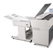
Production Print Stacking